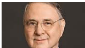
A Blueprint for Makeover in Spinoff