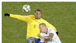
We Believed, Then Brazil Pounced