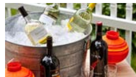
The Joy of 'Jug' Wines