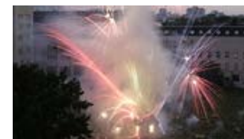
Chinese Artist Turns Gunpowder Into Art