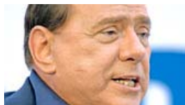
Paparazzo Stalks the Wily Berlusconi